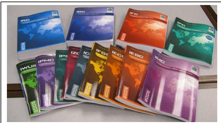
Picture 3: These various books contain the complete contents of the 2009 I-codes. Ten of these code books were adopted by the state Department of Labor and Industry for use in Pennsylvania. Each municipality in the state must have three full sets of those 10 code books at a total cost of $1,593.