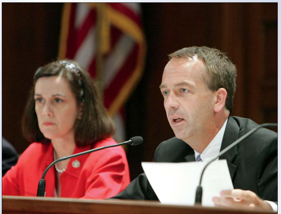
Senator Gordner questions a witness at a recent Capitol hearing. Also pictured is Senator Lisa Baker (R-Luzerne).

The committee also continued its work on the state's Uniform Construction Code by successfully passing a bill which was signed into law that establishes a Code Advisory Committee which will work with the Department of Labor and Industry to implement commonsense requirements for compliance with the code for construction in Pennsylvania. The committee will consist of local government representatives, code officials and representatives of the building industry.